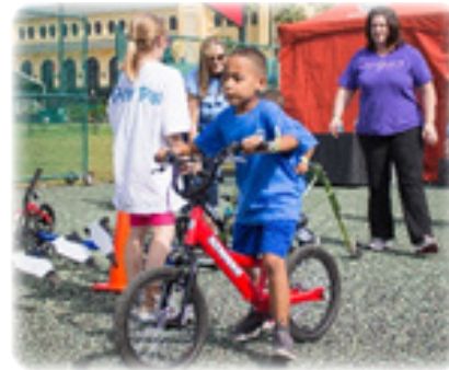
Strider Bike $99.00