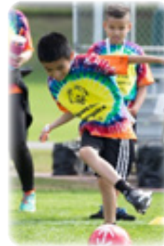
Little ELITES program $659.24