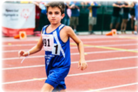
1 Athlete transportation for an event $24.00