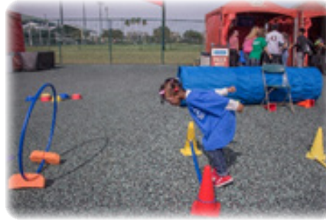
Complete health exam $62.50