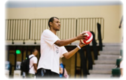
Choice of Coaches sports kit $431.00