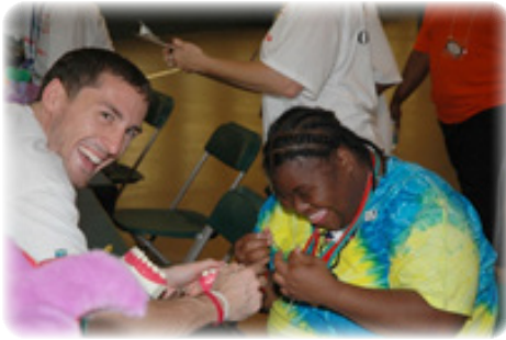
Young Athletes program ages 2-7 $659.24