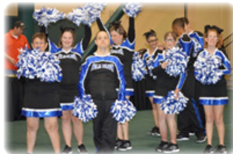
Cheerleading uniform with shoes $339.00