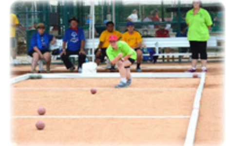
Portable bocce court $1,500.00