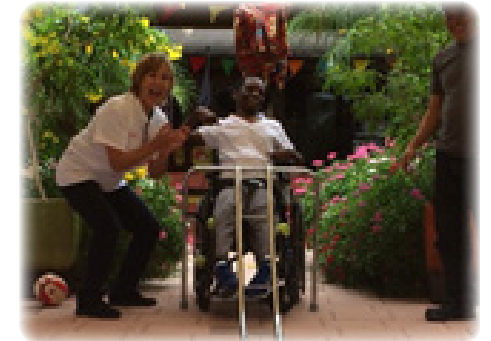
Motor Activities Training Program $250.00